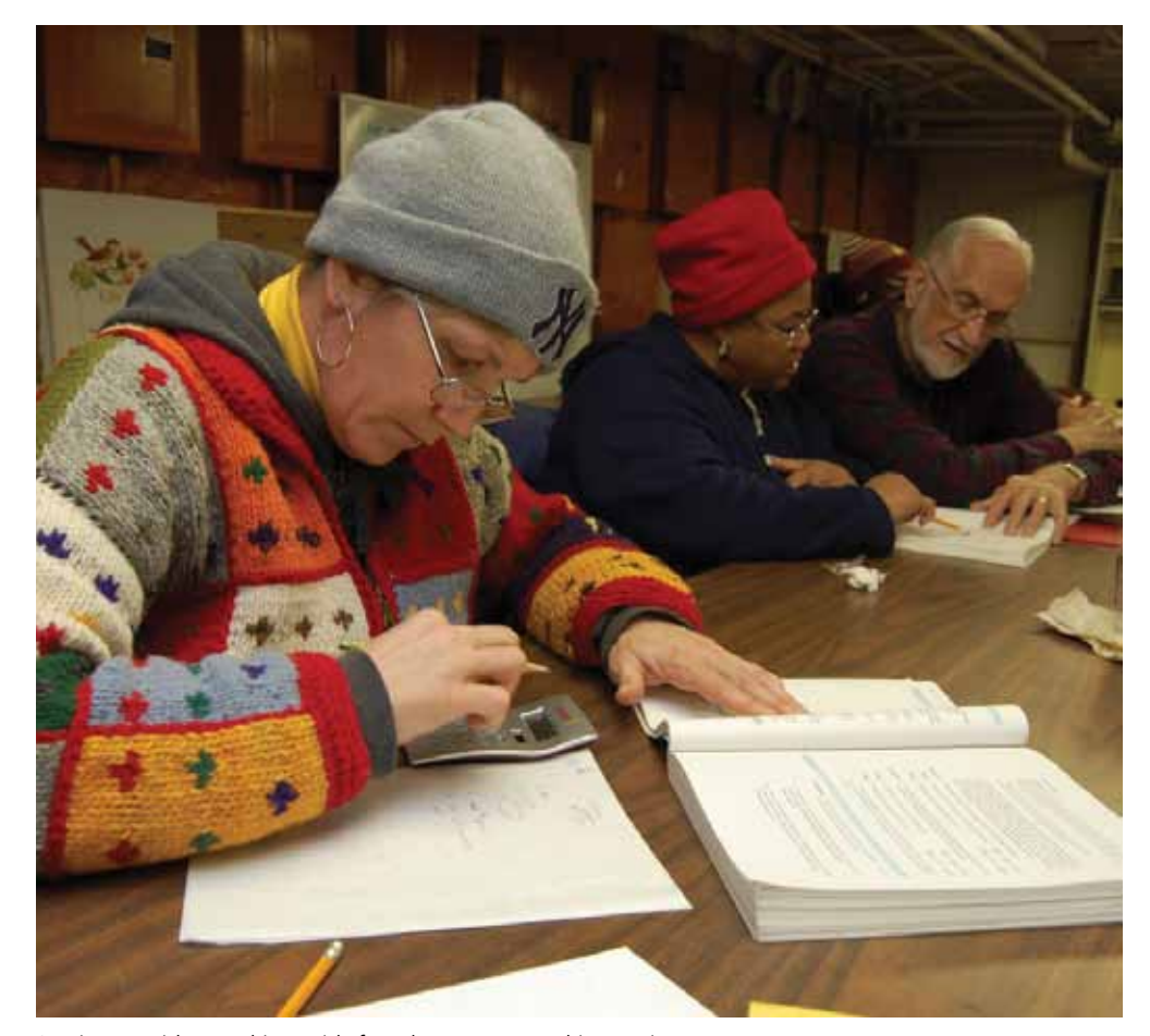
Service provider working with female veterans seeking assistance.